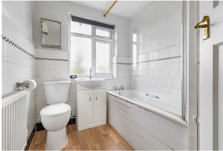
164 Shepherds Lane